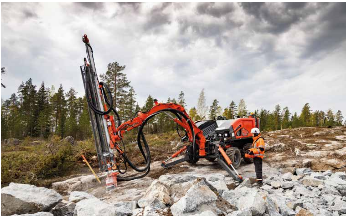
The drilling unit is extremely mobile and agile thanks to its rubber tires, four powerful tramming motors and \pm 10 degree oscillation.

Forget challenges. Maximize your mobility.